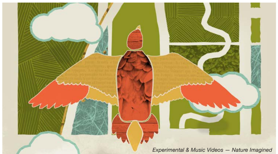
Experimental & Music Videos — Nature Imagined

Walking around Lake Celina one cold, sunny day, a distinct sound brought me closer to the edge. The sun did the rest.