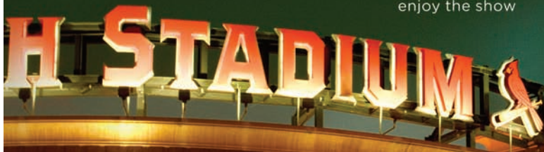
Busch Stadium, St. Louis