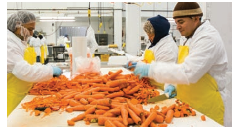
A Portrait of St. Louis at 250 Years