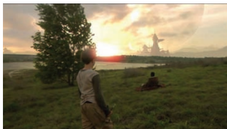
A Light in the Darkness

A dreamy trip back to college as a visitor.