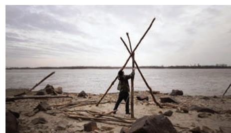
How to Build a Teepee