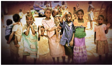
When the Saints