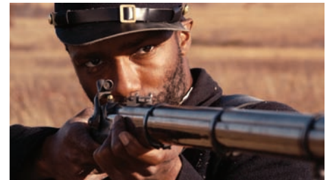
The Battle of Island Mound

New York City makes a critical decision to protect the woman he loves at the cost of his sense of belonging.