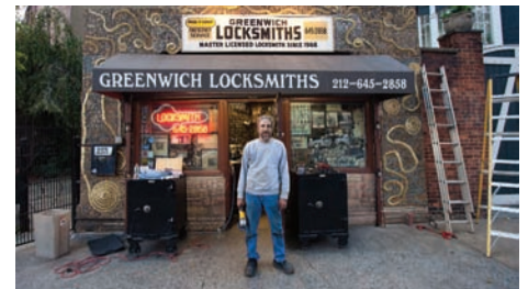
Do Not Duplicate

The inspiring story of a woman's 1,000-mile running pilgrimage from St. Louis to New York City to spread awareness, raise funds, and share stories of cystic fibrosis in honor of her sister.