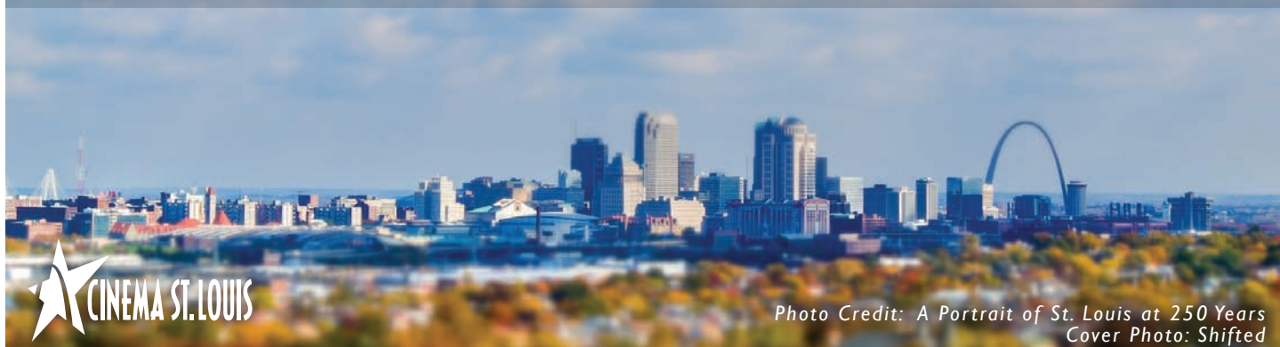
Photo Credit: A Portrait of St. Louis at 250 Years Cover Photo: Shifted

The Whitaker St. Louis Filmmakers Showcase, an annual presentation of the nonprofit Cinema St. Louis, serves as the area's primary venue for films made by local artists. The Showcase screens works that were written, directed, edited, or produced by St. Louis natives or films with strong local ties. The 16 film programs that screen at the Tivoli from July 13-17 serve as the Showcase's centerpiece. The programs range from full-length fiction features and documentaries to multi-film compilations of fiction and documentary shorts. Many of the programs with feature-length films include post-screening Q&As with filmmakers.