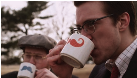
Getting to Bed

An advertising agent lives a boring life until one day when his curiosity causes the world to lose all color.