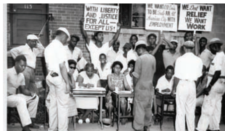
Against All the Odds