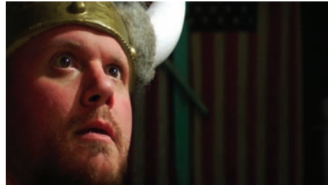
A Dungeon Master's Guide to Life

A woman who had been hospitalized for years after a literal attempt to "eat the world" comes home to live a normal life with her brother and his family.