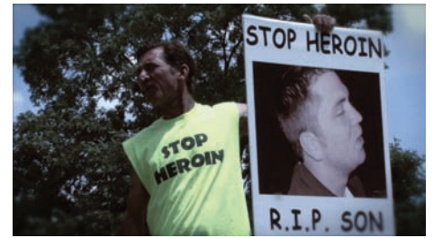
A Short Life