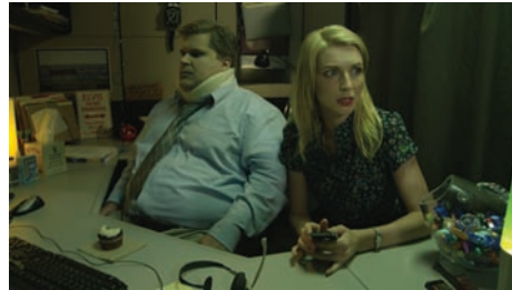
9 to 5 Feet Under

A documentary on the radioactive waste in the Westlake Landfill in Bridgeton, Mo., and how it affects local residents and workers.