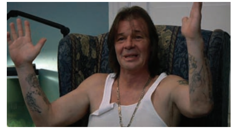
Rednecks + Culchies